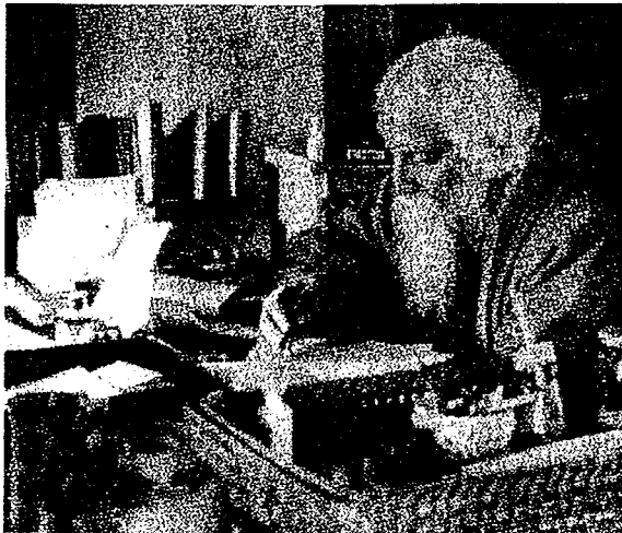
RABINDRA NATH TAGORE-